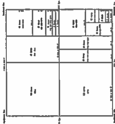
Rectangular Survey of One Section